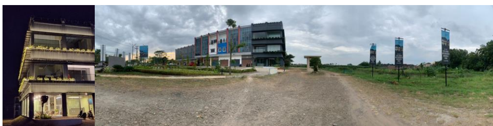
Marketing Gallery of Holdwell Business Park as of July 31, 2023

Landscape Progress of Holdwell Business Park's Marketing Gallery, as of July 31, 2023